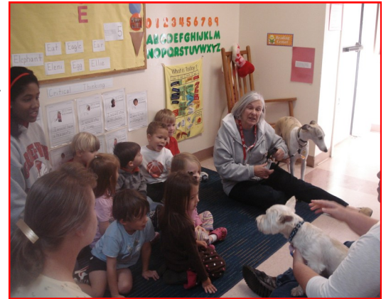
Therapy dogs visit the 3K classrooms